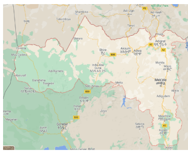
Google map of Tigray (L) demonstrates drone attacks on cities and towns (yellow plane symbols). This map (courtesy of @MapEthiopia, version 15 Jan 2022) shows areas under Tigrayan forces (red), Eritrean forces (green) and Amhara militia /Ethiopian forces (yellow). Google map of Tigray (R) is for reference to demonstrate Tigray's borders before 3 November 2020.

This is not a comprehensive list of Ethiopia's drone strikes in Tigray since the beginning of the conflict on November 3, 2020, but a highlight of the serial attacks outside combat zones over the last three months only, based on reports from the regional media and humanitarian sources.